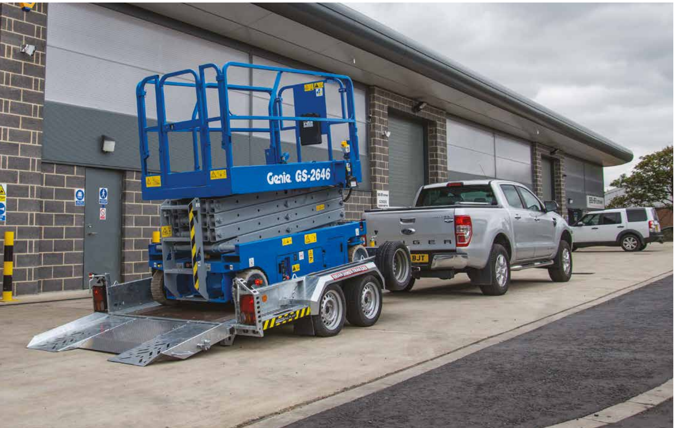
CARGO ALL PLANT TILTBED.